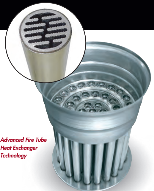
Advanced Fire Tube Heat Exchanger Technology