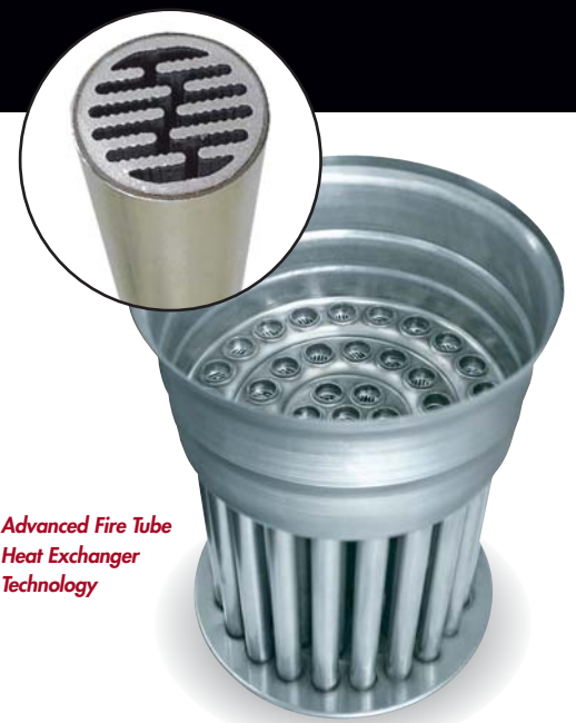
Advanced Fire Tube Heat Exchanger Technology