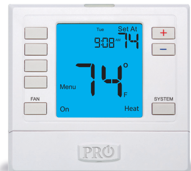
T755 • T755S • T755H

Quality Has Never Been Such A Good Value