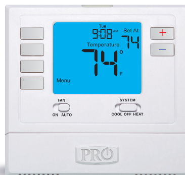
T705 • T715 • T721 • T725