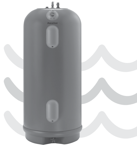
Marathon Heavy Duty 75, 85 and 105-Gallon Capacities 240 Volt AC/Single Phase Electric

Safety and Construction | These products are design certified by Underwriters Laboratories (UL) to meet UL safety standards and UL/NSF 005 as electric storage tank water heaters. All models are North Carolina and Massachusetts Code compliant. Certified for 150 PSI maximum working pressure.